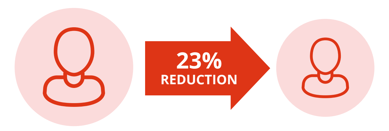
Fig. 5: In anticipation of TTR tapering, the total number of people employed is expected to reduce by 23% next FY on last FY