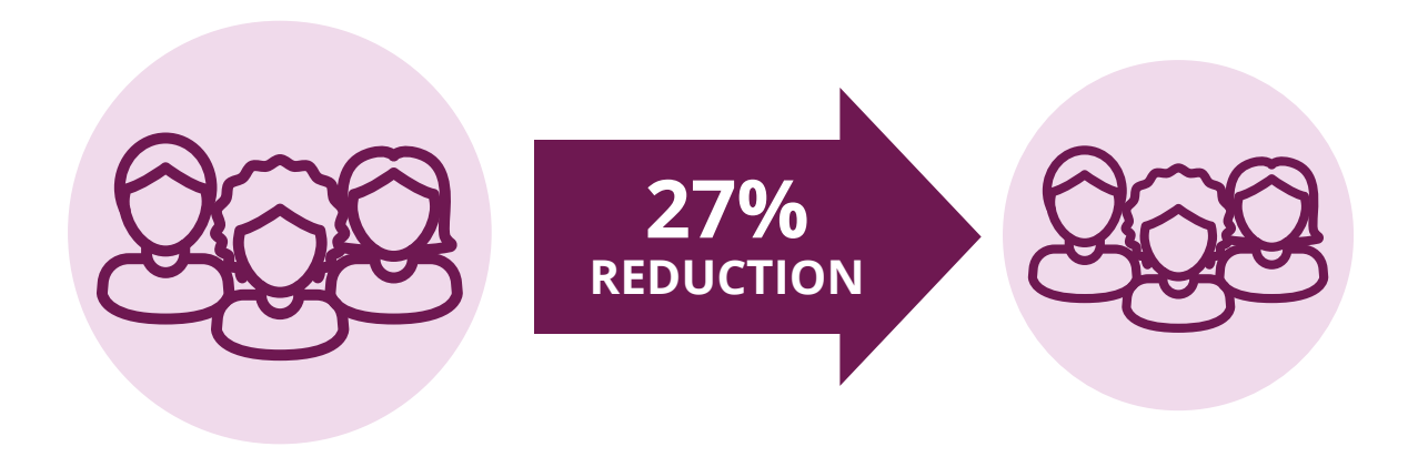
Fig. 6: If TTR rates were tapered in 2026, an average 27% decrease in audience reach is anticipated