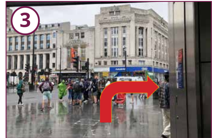
View from Exit 1 onto Charing Cross Road (Right).