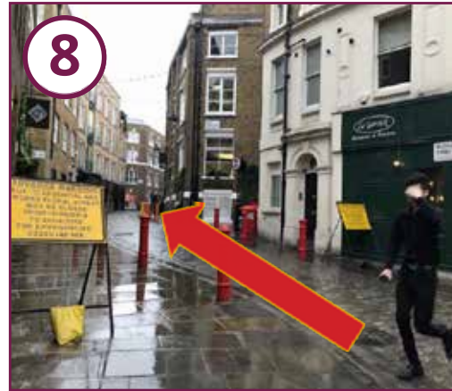
Continue on Garrick Street for 30 Yards then turn left onto Floral Street.