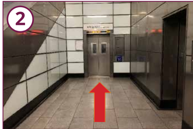
Exit 1 Lift.