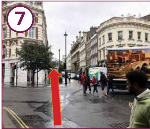
Walk straight across the crossroads onto Garrick Street (Five Guys on your left).