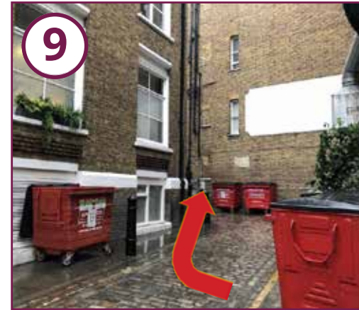
Take the first right turn onto Rose street.