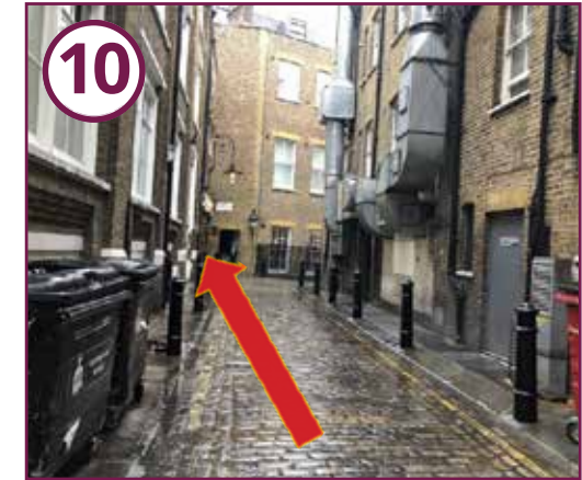
Follow the road around the bend, UK Theatre is the first office on your left.