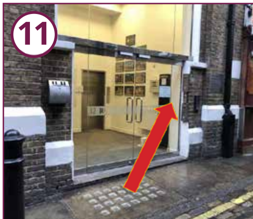
The office is next to the Lamb and Flag pub. Rose Street has large flagstones and cobbles. Entry is via the double glass doors. To enter, press the intercom to communicate with our reception team.