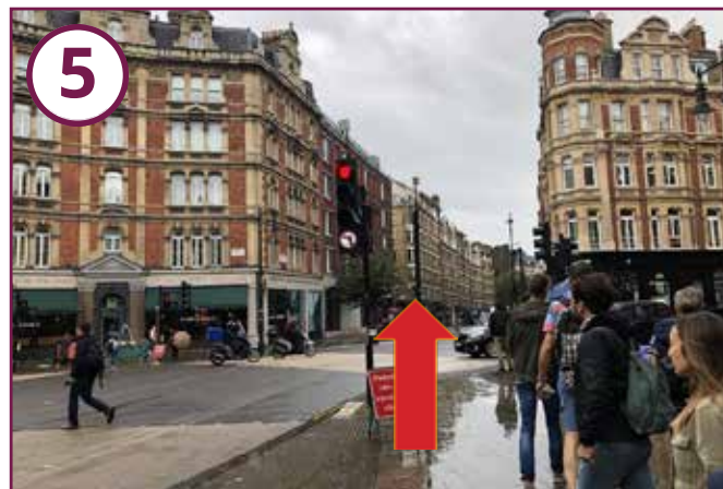
Continue straight across the crossroads (the Shake Shack will be on your left).