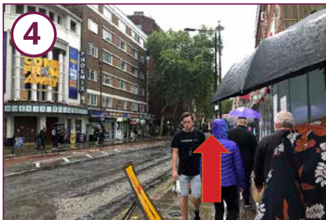
Follow Charing Cross Road 100 Yards (passing the Phoenix Theatre).