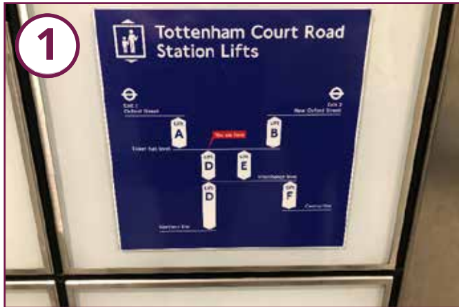
Map of Lifts at TCR.

START: Tottenham Court Road – Leave via Exit 1 onto Charing Cross Road (on your right)