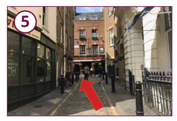
Continue towards the Lamb and Flag pub. Rose Street has large flagstones and large cobbles.