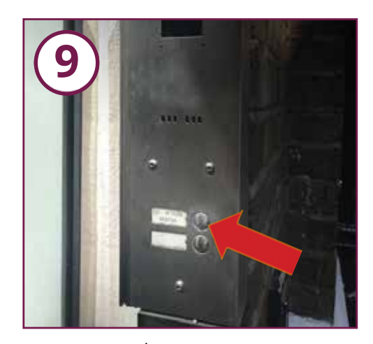
To enter, press the intercom to communicate with our reception team.

Leicester Square is not a step-free station. This route from the station to our offices is step-free. The journey is approx. 300m. Please call 020 7557 6700 if you require further assistance.