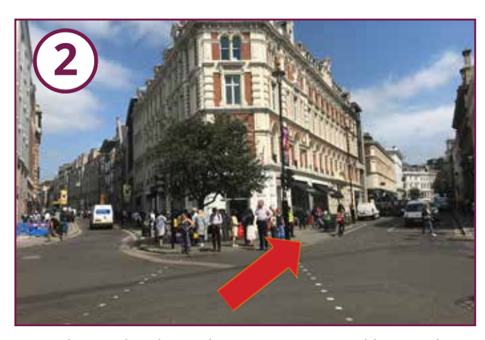
Cross the road at the pedestrain crossing and bear right onto Garrick Street.