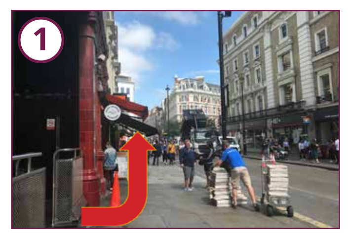
Head towards Exit 4 at Leicester Square station onto Cranbourne Street and take a left until you reach a crossroads.

Leicester Square is not a step-free station. This route from the station to our offices is step-free. The journey is approx. 300m. Please call 020 7557 6700 if you require further assistance. This is a step-free route from the station to our offices.