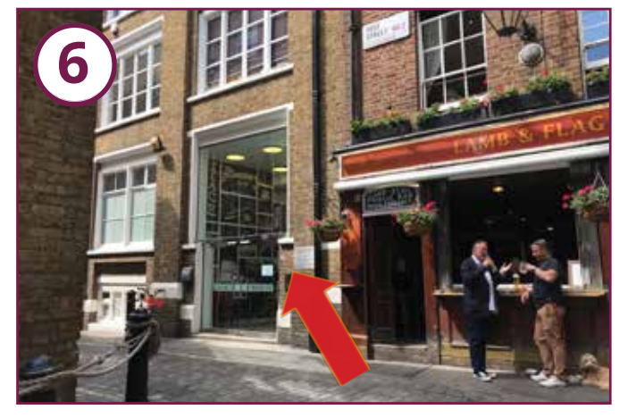
The office is next door to the Lamb and Flag pub. Entry is via the double glass doors. To enter, press the intercom to communicate with our reception team.