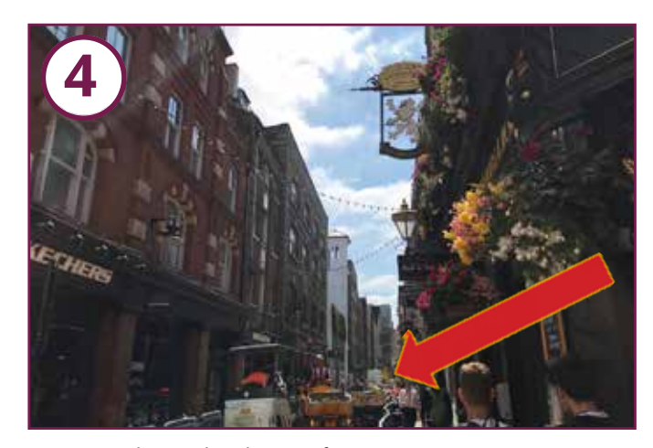
Continue down Floral Street for 200m.