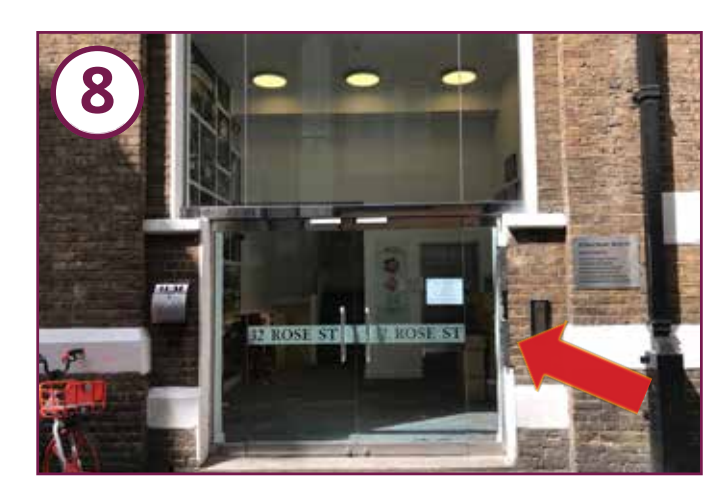
The office is next door to the Lamb and Flag pub. Rose Street has large flagstones and cobbles. Entry is via the double glass doors.