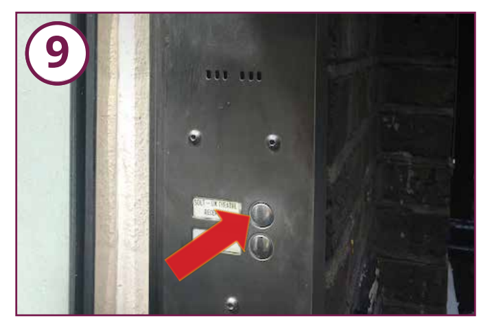
To enter, press the intercom to communicate with our reception team.