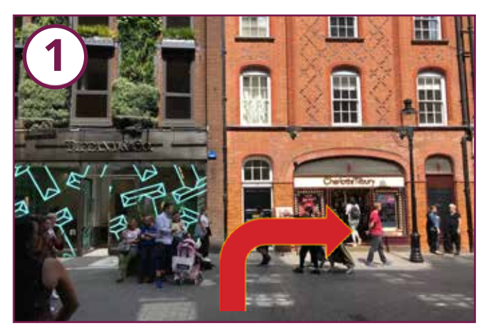
Exit Covent Garden Station and head right towards the main Piazza.

Covent Garden is not a step-free station. The route from the station to our offices is step-free. The journey is approx. 300m. Please call 020 7557 6700 if you require further assistance. This is a step-free route from the station to our offices.