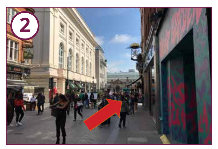
Continue for 20m until you reach the White Lion pub.