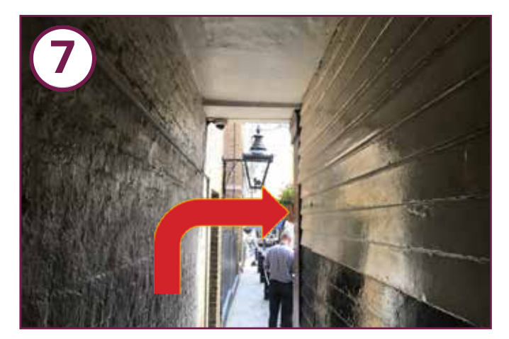
Walk through the alleyway. The Lamb and Flag pub will be on your right.

Covent Garden is not a step-free station. The route from the station to our offices is step-free. The journey is approx. 300m. Please call 020 7557 6700 if you require further assistance.