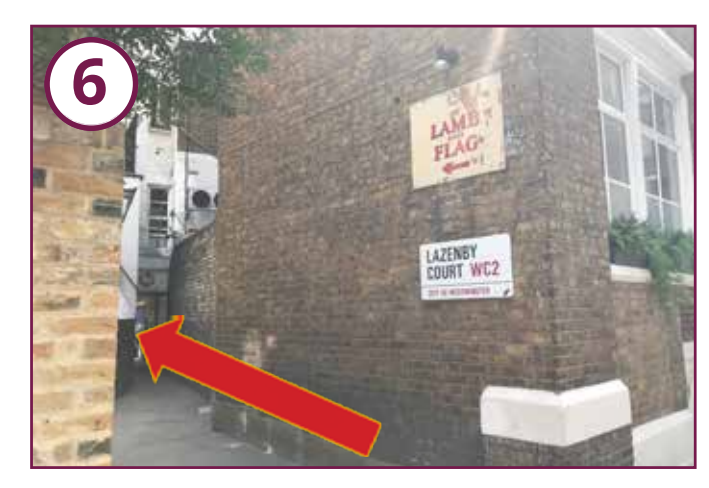
Take a left down Lazenby Court through the enclosed alleyway.