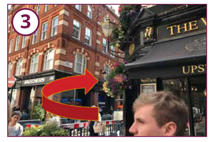
Turn right down Floral Street. Floral Street has large flagstones either side and large cobbles in the centre of the street.